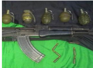
SUPPORT TO ECOEXTREMISM HAIL NATURE 88 👁 1477 11:07 PM