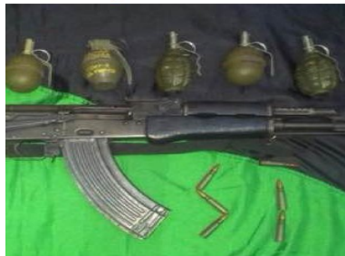
SUPPORT TO ECOEXTREMISM HAIL NATURE 88 1477 11:07 PM