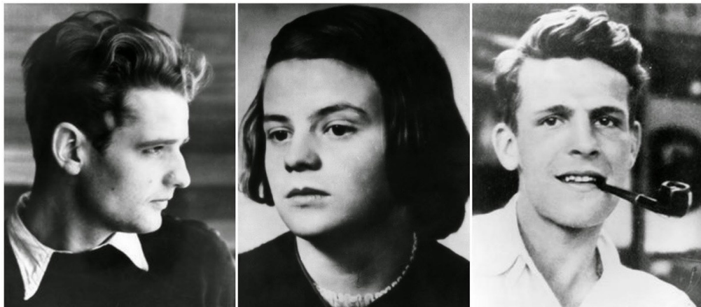
Hans and Sophie Scholl and Christoph Probst.

“I am an anarchist. We have been hanged in Chicago, electrocuted in New York, guillotined in Paris and strangled in Italy, and I will go with my comrades. I am opposed to your Government and to your authority. Down with them. Do your worst. Long live Anarchy.”