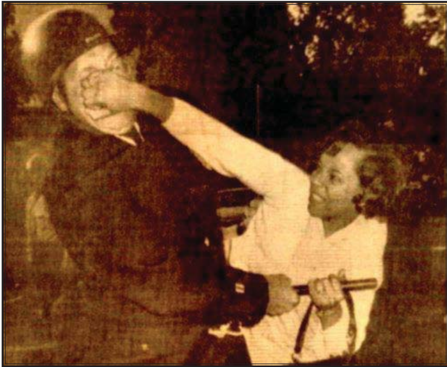
The other civil rights movement.

It is not our desire to participate in violence, but it is even less our desire to lose. If we do not resist, actively, when they come to take what we have won back, then we will surely lose. Do not confuse the tactics that we used when we shouted 'peaceful' with fetishising nonviolence; if the state had given up immediately we would have been overjoyed, but as they sought to abuse us, beat us, kill us, we knew that there was no other option than to fight back. Had we laid down and allowed ourselves to be arrested, tortured and martyred to 'make a point,' we would be no less bloodied, beaten and dead. Be prepared to defend these things you have occupied, that you are building, because, after everything else has been taken from us, these reclaimed spaces are so very precious." [5]