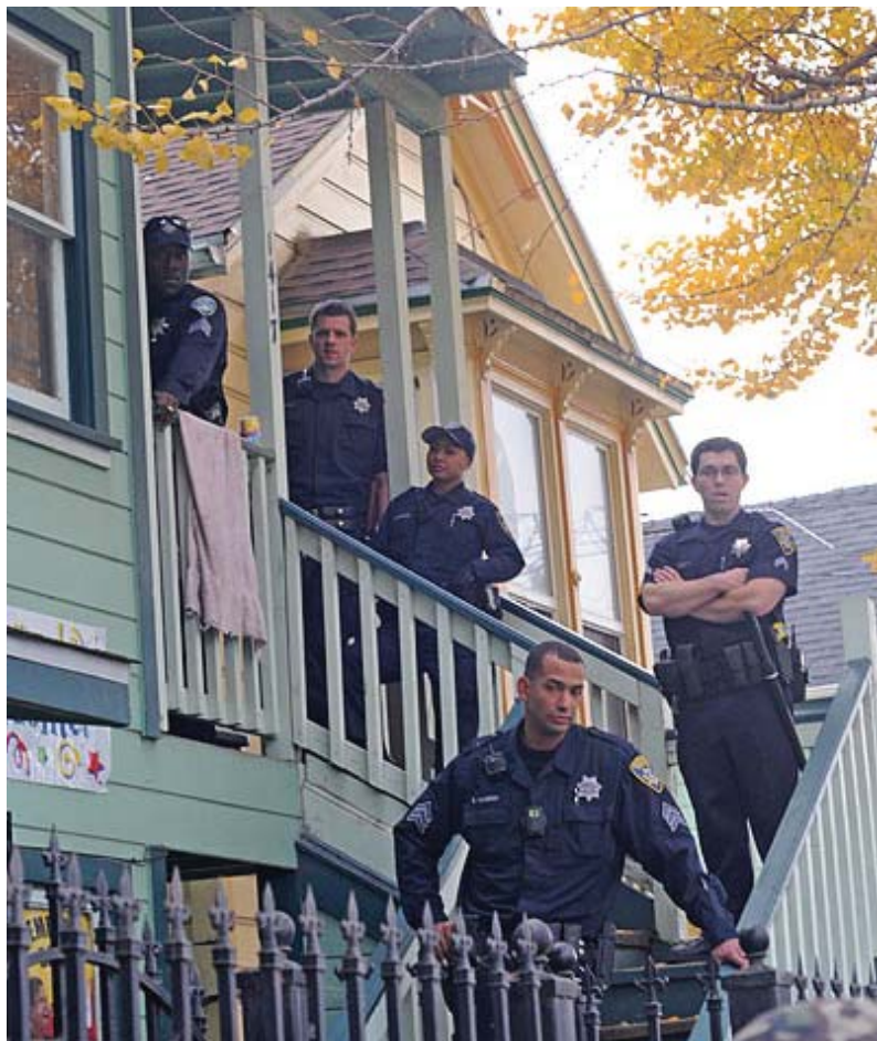
Oakland police preventing the reoccupation of a property in the process of foreclosure. 90% of Oakland's foreclosures are concentrated in 3 largely black and brown zip codes, 94621, 94603, 94605.

From the beginning the Occupy Oakland encampment existed in a tightening vise between two faces of the state: nonprofits and the police. An array of community organizations immediately began negotiating with city bureaucracies and pushing for the encampment to adopt non-violence pledges and move to Snow Park (itself later cleared by OPD despite total compliance of individuals who settled there). At the same time, police departments across the Bay Area readying one of the largest and most expensive paramilitary operations in recent history. It became