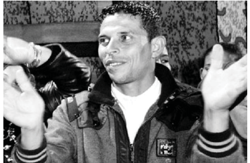
Mohamed Bouazizi, the Tunisian street vendor whose suicide helped spark the “Arab Spring.”

Nearly fifty years after the dramatic upsurge of wars of national liberation fought over the terrain of what used to be called the “Third World,” there are few political tools for confronting emerging local and global racisms between nonwhite communities, and the persecution of ethnic minorities in former colonies by native, nonwhite elites. In the US, this has taken the form of increasing antiblack, Islamophobic, and anti-immigrant racism within “communities of color” and increasing class divisions within nonwhite demographic categories.