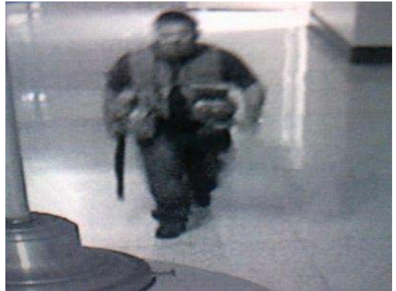
Real estate mogul and city power broker Phil Tagami patrolling the Rotunda Building with a shotgun on the day of the November 2nd Oakland general strike.

increasingly clear that the city’s reputation for progressive activism could not tolerate the massing of Oakland’s homeless, and the extent of urban social damage, made visible in one location.