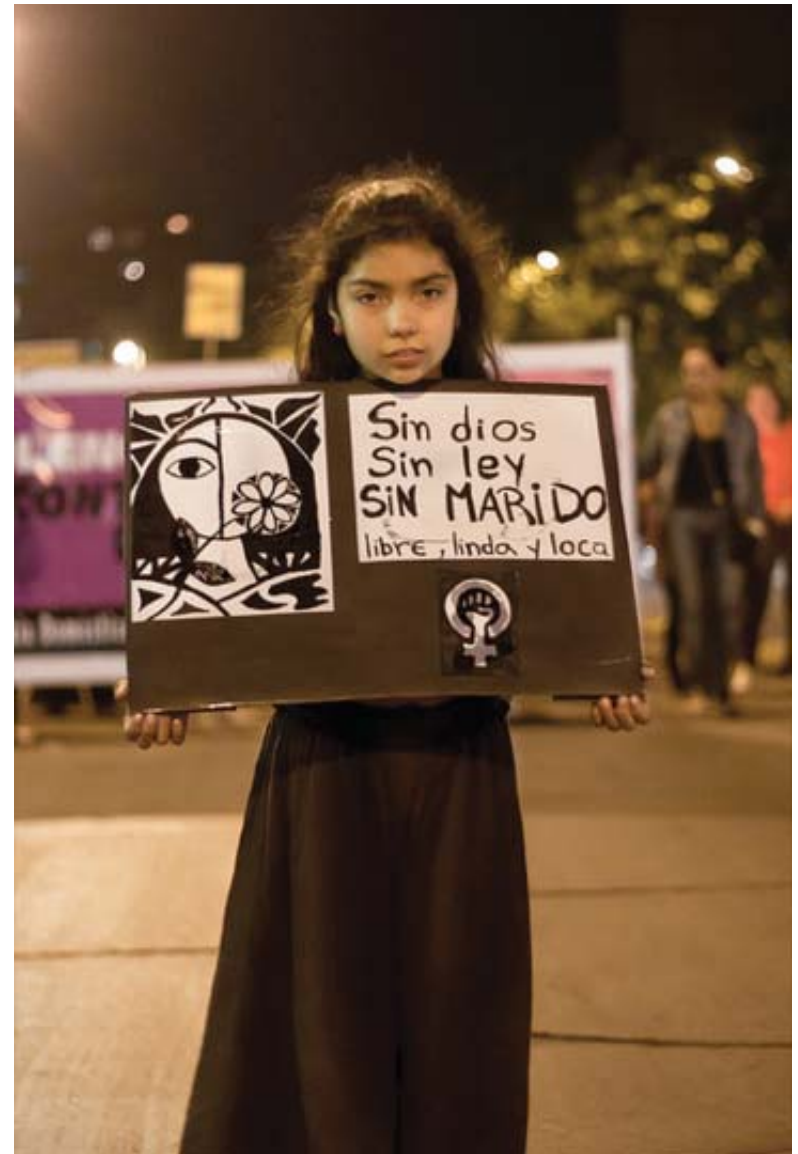
Young Chilean feminist: “Without god, without law, without husband: free, beautiful, and crazy”